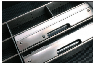
» Fits in all drawer systems