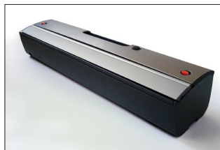
» Use on the working table