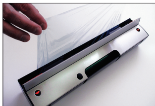
» Cutting procedere through electrical wire