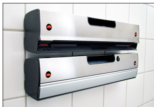
» Wall mounting