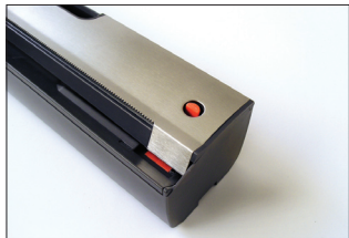
» Functional design