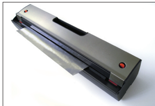
» Use on the working table